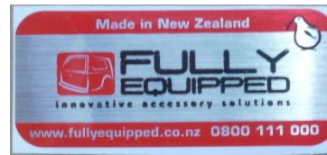
Accessory Solutions Decal - 65mmx30mm YC-15-DECAL-C3