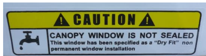
Sticker Dry Fit Decal (YC-15-DECAL-DRY)