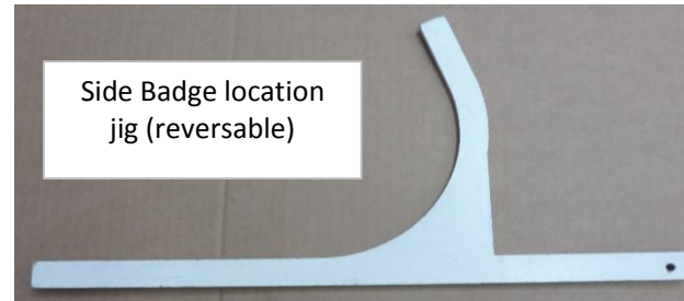
Side Badge location jig (reversible)