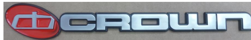
Crown Rear Door Badge YC-15-DECAL-C4