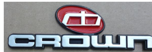
Crown Canopy Logo - Moulded Side Badge YC-15-DECAL-C1