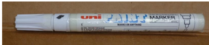
White touch up paint

3) In the event that the screw protrude through the other side of the shell - remove any sharp edges and touch up using white paint or flow coat