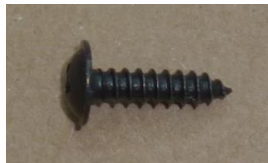
YC-11-85/8BC 8 x 5/8 Mushroom Pozi Black

2) Secure the edge trim using 8 x 5/8 Mushroom Pozi Black screw